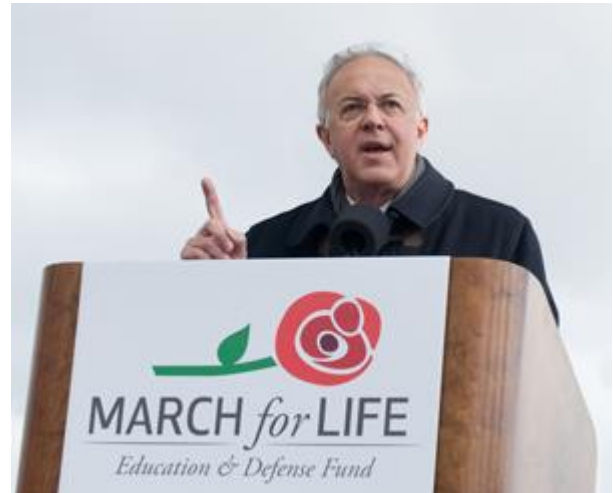
Supreme Knight addresses participants at rally