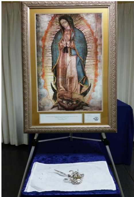
The silver rose graces the display of the icon of Our Lady of Guadalupe, Patroness of the Americas. The icon includes a second-class relic. (It's that small dot in the area on the bottom right of the frame.)