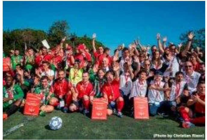
KNIGHTS OF COLUMBUS SUPPORTS SPECIAL OLYMPICS UNIFIED SOCCER TOURNAMENT IN ROME