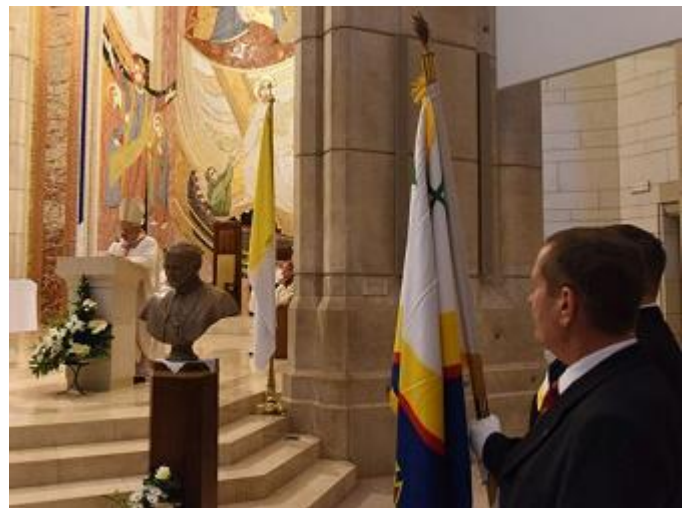
BUST OF ST. JOHN PAUL II, A GIFT FROM THE KNIGHTS OF COLUMBUS, DEDICATED AT THE ST. JOHN PAUL II SHRINE IN KRAKÓW